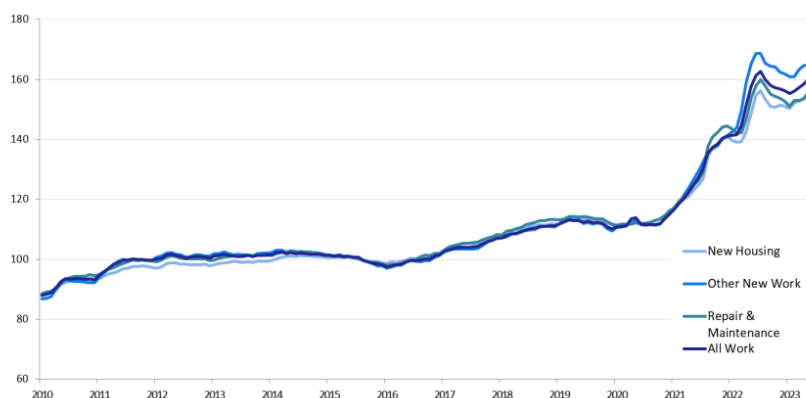
Chart 2: Construction Material Price Indices, UK Index, 2015 = 100